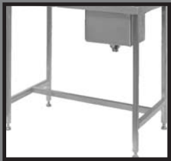
Base Leg Assembly