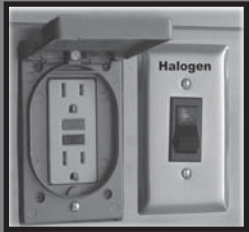
GFIC Waterproof Receptacles