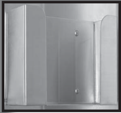
Paper Towel Holder