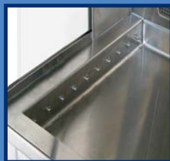
Dissecting Area Rinse